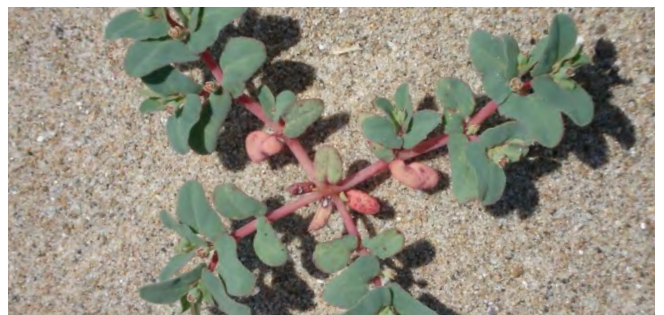
Purple spurge- Euphorbia peplis