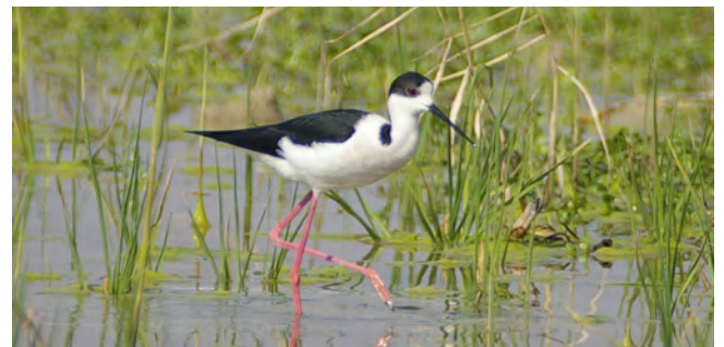
Black winged stilt - Himantopus Himantopus