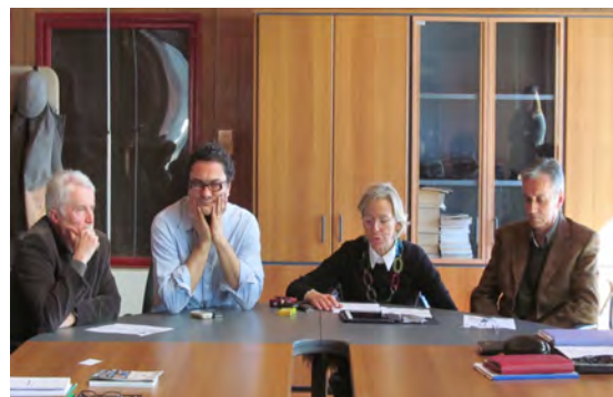
Working table on Eco-tourism package

While the restoration works are proceeding, the Municipality of San Benedetto del Tronto, together with the Tourist Consortium "Riviera delle Palme" is conducting an interesting initiative to enrich the local tourist offer, towards greater sustainability. The initiative, in cooperation with the National Park of Monti Sibillini, aims to launch a new "eco-tourism package": a range of holiday proposals between San Benedetto and the National Park, including services and outdoor activities, such as bird watching, kayaking and nature walks. The package, including proposal for "active holiday" and suitable combinations for school trips, has been submitted to national and local tour operators who are checking for the offer regarding meals, accommodation and integrated transport.